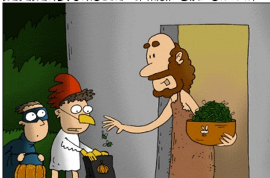
GREAT COSTUMES ... HERE, HAVE SOME LOCUSTS